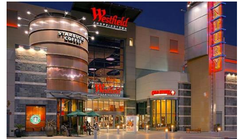
Shown here, Oakridge Mall. Ministry in the Mall, what a great idea!

Some of our ministry partners have been involved in a strategy this spring called "God Talk in the Mall." They had 300 HOPE DVDs (English and Spanish) on hand to give to people who were interested to know more. Here's what they reported after one of their weekends, "We had a grace-filled weekend at the God Talk. We had 67 people stop at the kiosk and take our survey; 39 of the 67 wanted follow up! We are not sure exactly how many DVDs were handed out, as we had 45 volunteers on two-hour shifts all day Saturday and Sunday, with four people per shift."