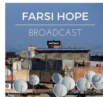
In closed access countries that are ripe for harvest, the Gospel is going forth!

The Farsi HOPE was broadcast at strategic times throughout the Easter weekend. Both The Farsi HOPE and The Turkish HOPE are now being broadcast regularly via satellite into Iran and Turkey, respectively. Please pray that God superintends these broadcasts and that many are quickened by God to respond to the Gospel as they watch The HOPE.