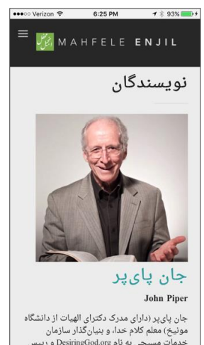
What an honor to be included with teachers like John Piper.

85% of evangelical churches globally are led by pastors who have no access to formal education or training. To aid in this theological famine, The Gospel Coalition has been translating theological and biblical resources (ie; John Piper books, study bibles, etc.) for pastors and elders of churches in these least reached areas. Mars Hill has been invited to collaborate with The Gospel Coalition by making The HOPE available in a variety of new ways so international church planters can be equipped to teach the meta-narrative of scripture to their congregations. The Farsi HOPE and Study Guide will soon be available on this TGC website: http://www.mahfeleenjil.com/ with a new download option as well. TGC intends to share The HOPE in all available languages with their network of reformed missionaries and church planters working around the globe.