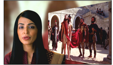
Storyteller for the Hindi version of The HOPE

Produced by Mars Hill, The HOPE is an 80-minute dramatic motion picture presentation of God's redemptive story as revealed in 36 biblical events from Creation through Christ. The HOPE uses "on-screen" storytellers to tie together an amazing amount of dramatic footage from some of the greatest Biblical epics ever produced. These storytellers can be replaced from one people group to the next. The result is a culturally sensitive, complete view of God's grand story of redemption! For reasons of security and/or cost, some translation partners use an "off-camera/audio-only" storyteller. Either way, for missionaries around the world, The HOPE has become more than just a movie. It has become a "go-to" media tool for evangelism, Church planting and discipleship.