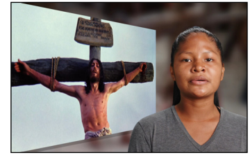
Storyteller for the Ticuna version of The HOPE

The next day -Tuesday- one of our board members was hosting a ministry group in his restaurant in Florida. He met a woman in the group with a Spanish surname and felt led by the Spirit to ask her where she was from and learned that she was from Peru. Again, led by the Spirit, he asked "Where in Peru?" She responded "the Amazon." Our board member shared that he is with a ministry (Mars Hill) that is working in Peru on the Amazon. He then pulled out his mobile phone to show her the report he had just received, which included the name of the village. She began to weep, "That is my village!" She then proceeded to share her story. "My father was a good man. When he was alive, it was a good village, but when he passed away, things changed. I was trafficked to the U.S., but eventually I was rescued. Now I am finding healing in my Church . . . and today, you are telling me that God has come to my village!" Her tears were tears of joy!