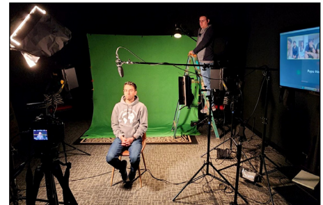
STTN training a film team for a production hub in Asia.

In 2018 we helped a missionary group, School to the Nations, build a production studio which is dedicated to the creation of new translations of The HOPE. STTN has grown, and this year STTN is actually working on more new HOPE translations than Mars Hill! STTN is establishing HOPE production hubs around the world. Each production hub will partner with indigenous people groups in the region of that hub in order to create new translations of The HOPE and The HOPE Study Guide.