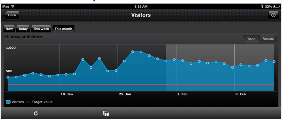
This graph shows our recent increase in traffic.

<u>TheHOPEProject.com</u> is our website that streams The HOPE and provides help for seekers in many of the world's major languages.